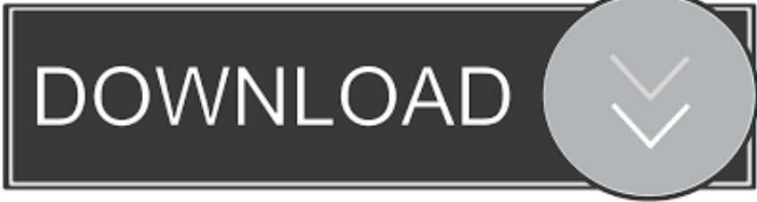
FULL Fabrication ESTmep 2007